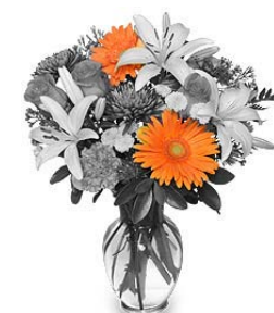
Spot Color: $85