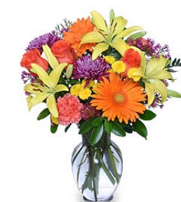
Full Color: $300