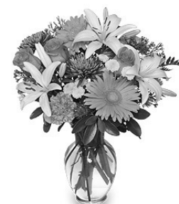
Grey Scale: FREE